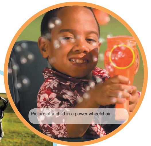
Picture of a child in a power wheelchair